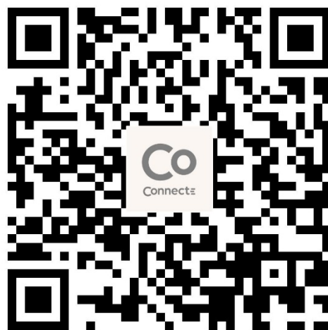
QR code to Connecte app download